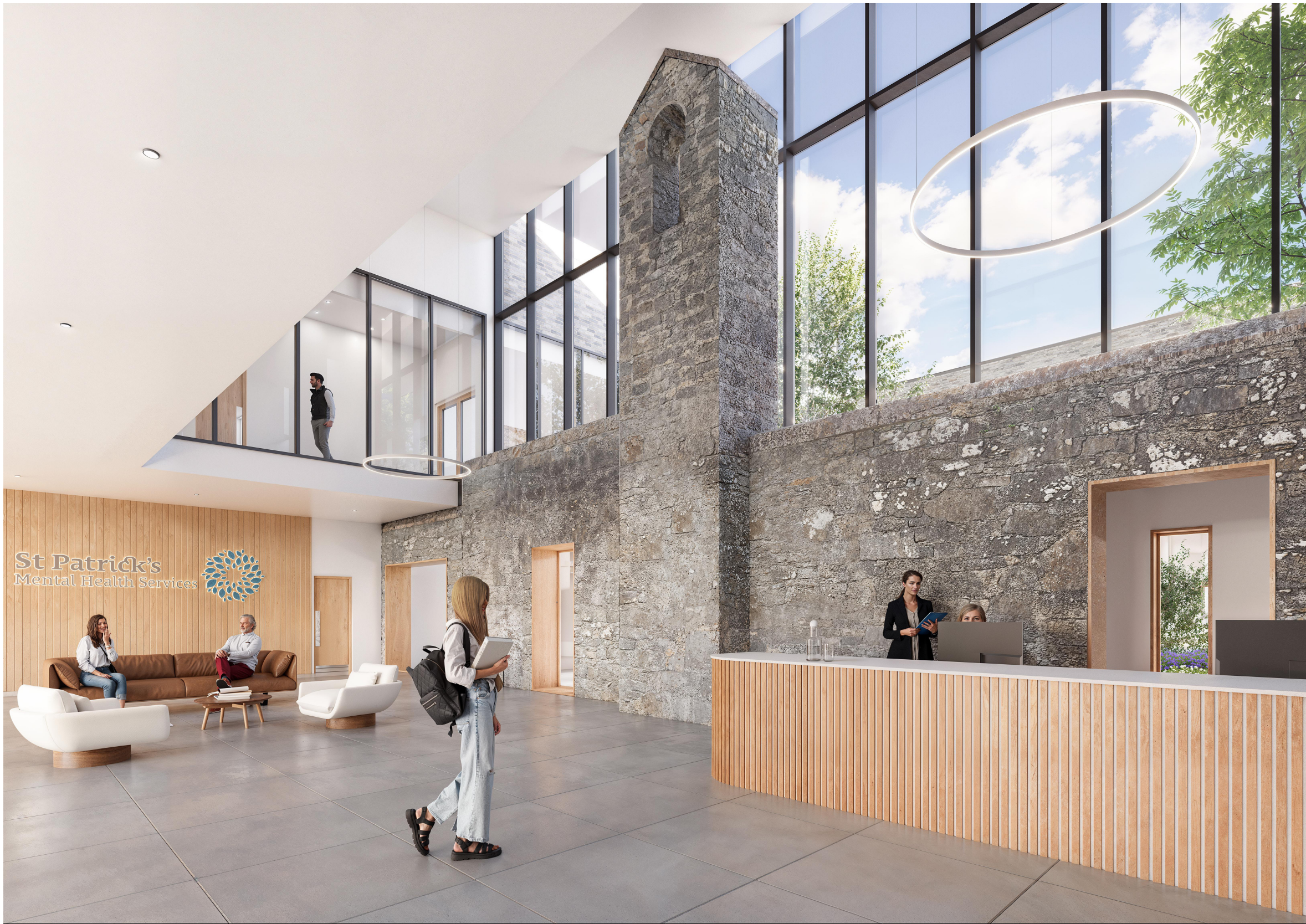
200-bed Adult In-Patient Hospital Reception & Public Entrance Foyer

COPYRIGHT: The design and details shown on this drawing are applicable to The Named Project only and may not be; reproduced, modified or relayed in whole or part or be used for any other project or purpose without the prior written permission of TOT Architects with whom copyright resides. DO NOT SCALE this drawing. Use figured dimensions only. The Contractor is responsible for checking all levels and dimensions on site prior to commencement of works. Any discrepancies are to be referred to the ARCHITECT. Drawings to be read in conjunction with all other Consultants Drawings & Specifications were relevant. Proprietary items shall be fixed in strict accordance with the Manufacturer's Instructions. Sizes of proprietary items shall be checked with Manufacturer.